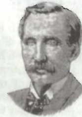
W.D. Hoard Founder, 1870