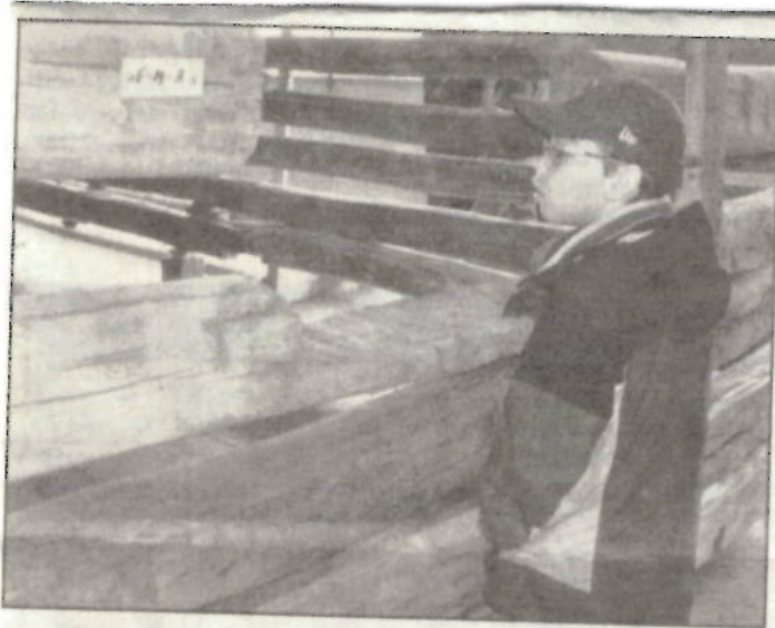
a cross-section of the trunk of a landmark bur oak tree that was cut down recently to accommodate a new bypass along Highway 26 between Fort Atkinson and Milton. Many local residents fought to save the tree, at least a century and a half old, but the Wisconsin Department of Transportation was unable to change its plans and the tree was chopped down in May 2013. Now the parks department has obtained a section of the trunk and plans to sell cross-section "cookies" to fund the planting of new trees along the Glacial River Trail.